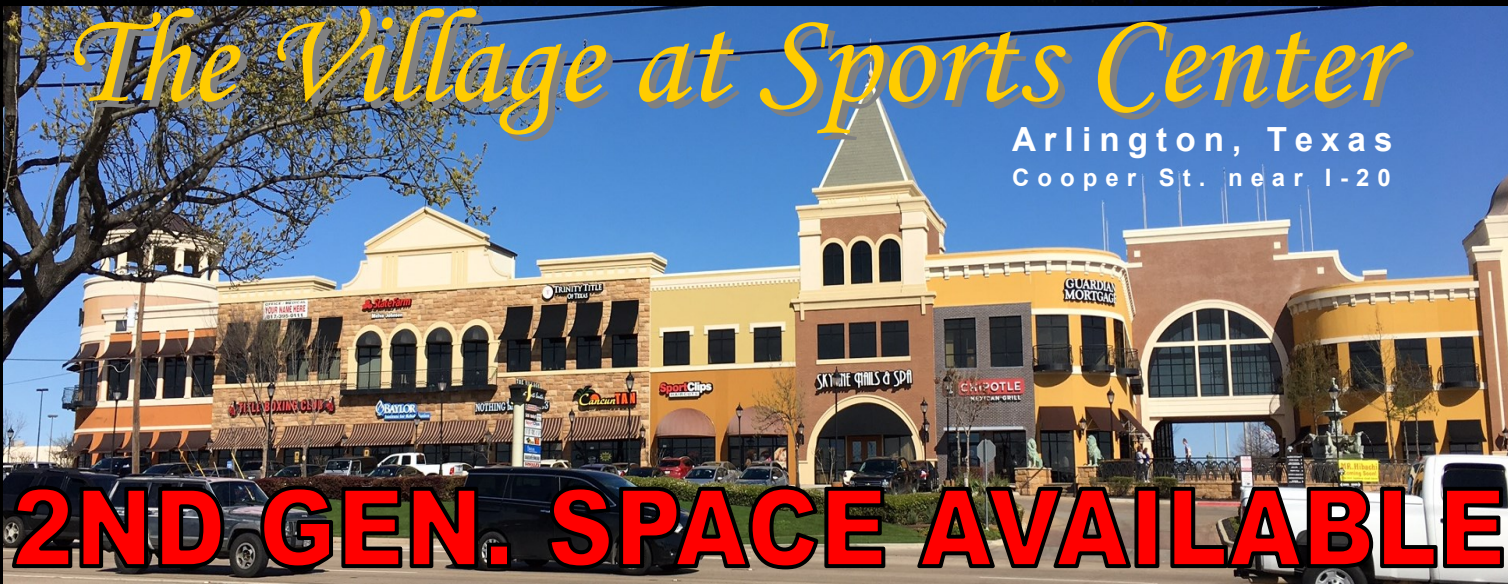
Arlington, Texas Cooper St. near I-20